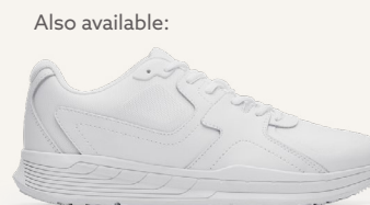
Condor II White: 22336

Slip resistance test according to EN ISO 20344:2021, conducted by Intertek Testing Services Shenzhen Ltd., in August 2022; on a scale of 0.0 (without slip resistance) to 1.0 (very high level of slip resistance, e.g. on dry carpeted floors). All SFC shoes are fitted with the patented, slip-resistant Shoes For Crews outsole.